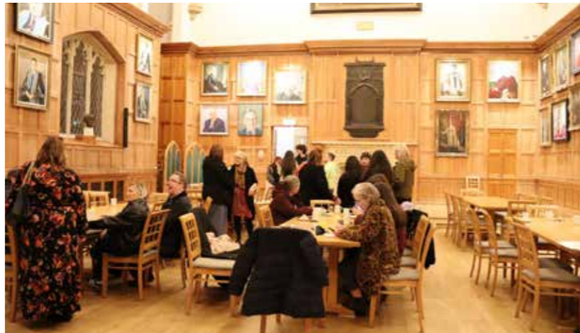
DPCE cross-community showcase in the Great Hall at Queens University with the support of Queen's Communities and Place