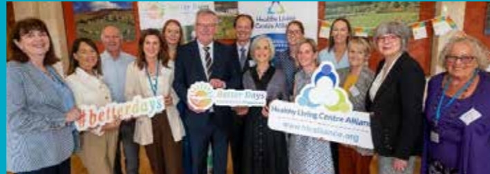
Members of the Better Days Steering Group with the Health Minister Mike Nesbitt at the Better Days Celebration Event in Stormont, June 2025

The programme was recently shortlisted for an Advancing Healthcare Award for Partnership Working in Public Health