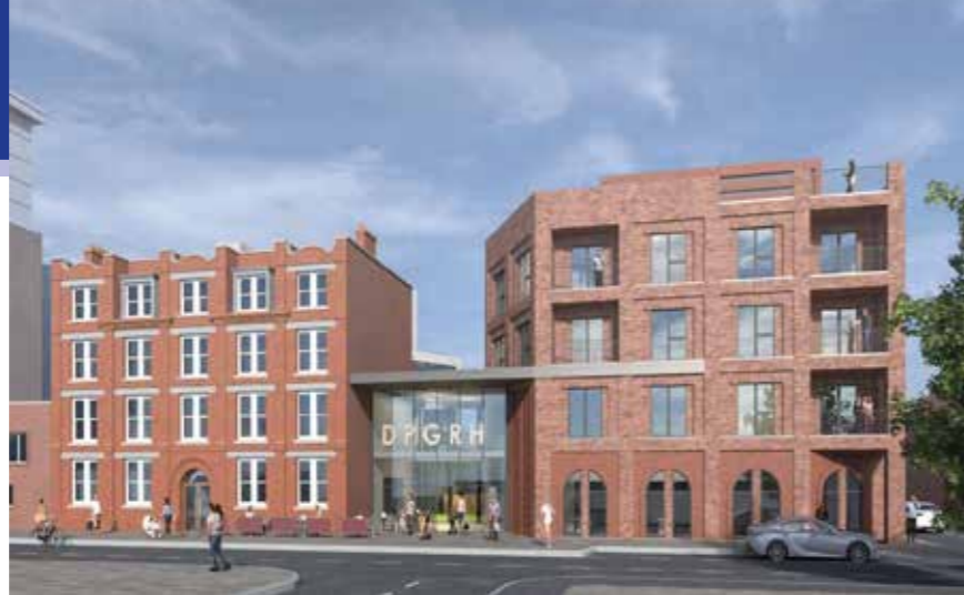
Architect's image of the new Good Relations Hub on Donegall Pass

In the initial stages of this project, the women's group identified a few different things they were interested in; community notice boards, storytelling and community street celebrations. At the start of the development of the project the group was interested in creating a bench that was detailed with community stories, so people could either sit together and share a story or sit alone and read one. As the project developed, time limits meant the group had to rethink the project. They decided to focus on creating artwork from archive images of street celebrations, street parties and festivals. Community street celebrations are an integral part of the rich heritage and community spirit that makes Donegall Pass. The artworks were made through the mediums of drawing and printmaking. This project has allowed the women to try out lino printing and mono printing and included a workshop in a professional print studio. These print designs will be used as the design for the bench they will create in the future.